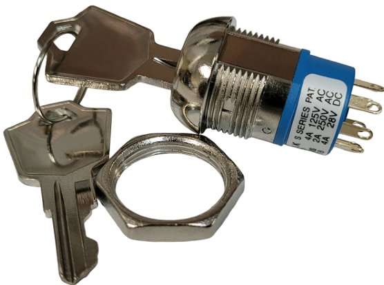
Key Switch, Chrome, with Push-On Terminals Part Number: EGO-10020