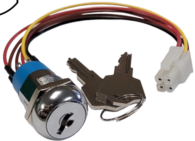
Key Switch, Chrome, with Wires and Connector Part Number: EGO-10021